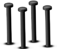
ITEM 3: Screws (4)